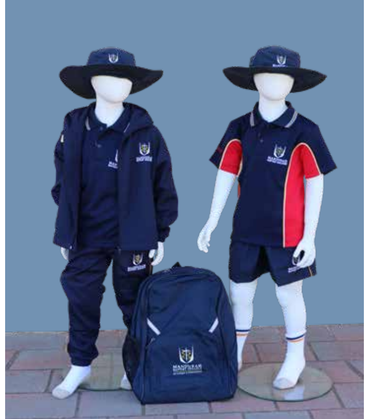
Kindergarten to Year 2 — Uniform

Shoes should be comfortable, supportive trainers. They are permitted to be lace-up or Velcro.