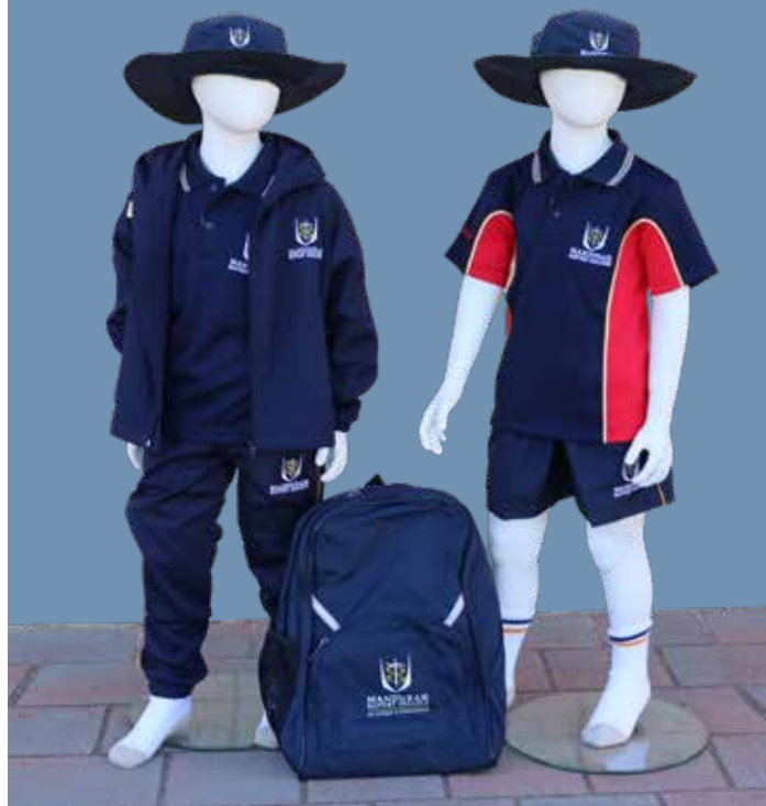
Kindergarten to Year 2 — Uniform

Shoes should be comfortable, supportive sneakers. They are permitted to be lace-up or Velcro.